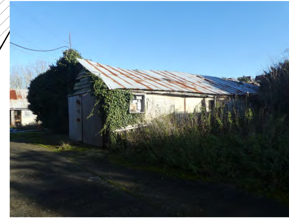
Outbuilding 7.6x2.6x3.9m high