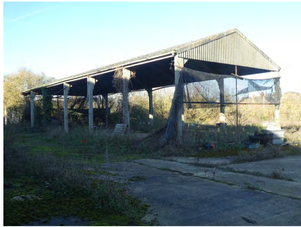
Open Dutch barn 26.8x9.2x6.6m high