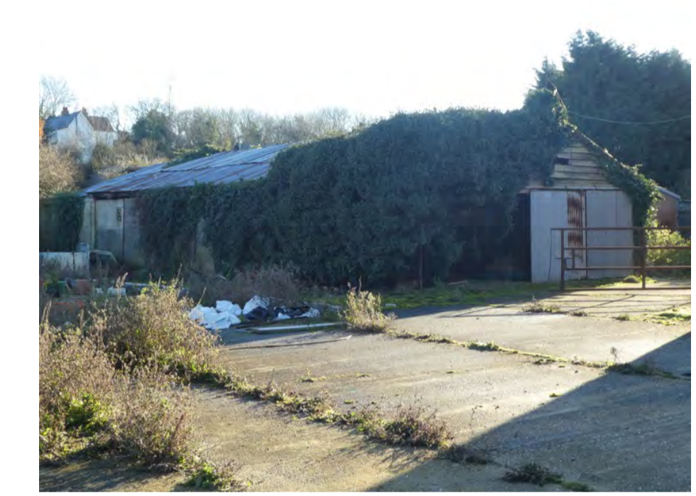
Outbuilding 7.6x2.6x3.9m high