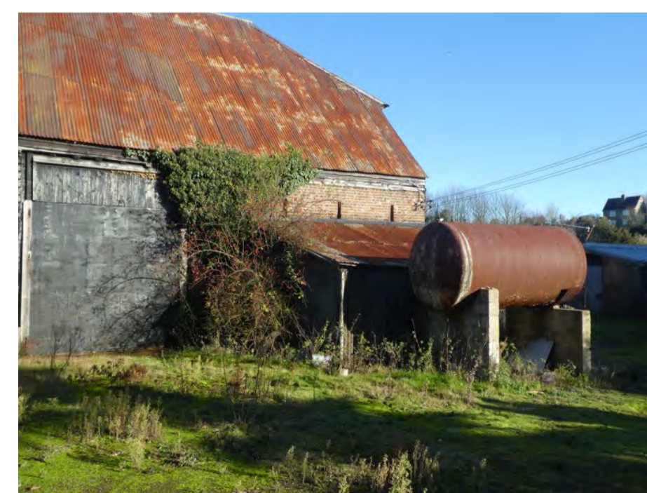
Lean-to 2 5.2x3.9x3.4m high

Proposed conversion of existing barns at Queen Court Farm, Water Lane, Ospringe