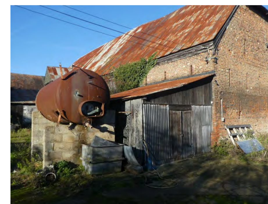
Lean-to 2 5.2x3.9x3.4m high