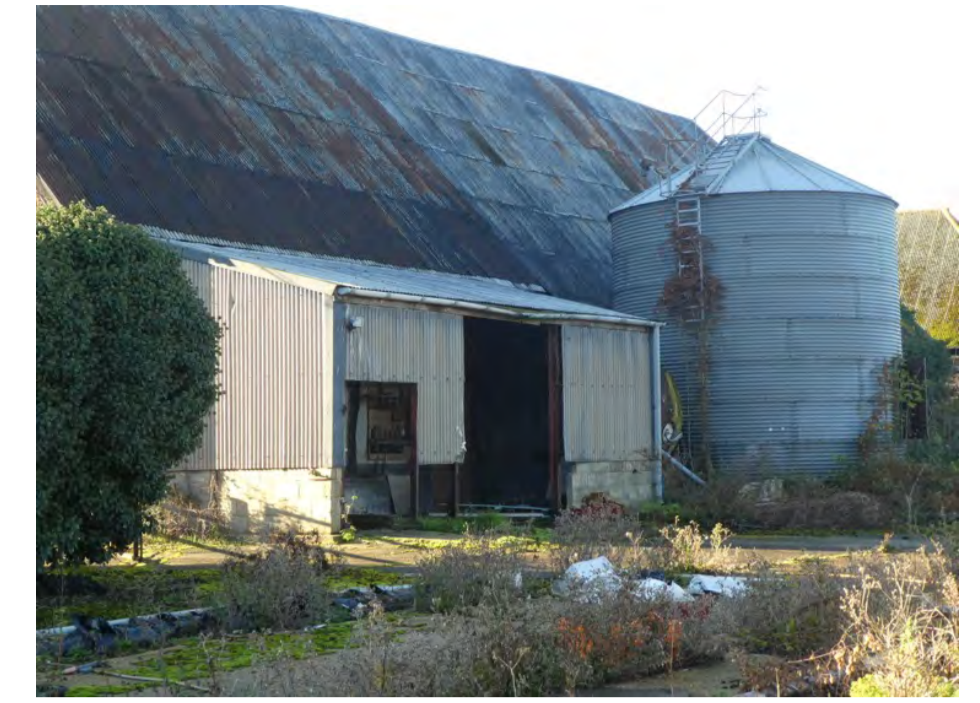
Silo 5.5m diameter x 6.8m high