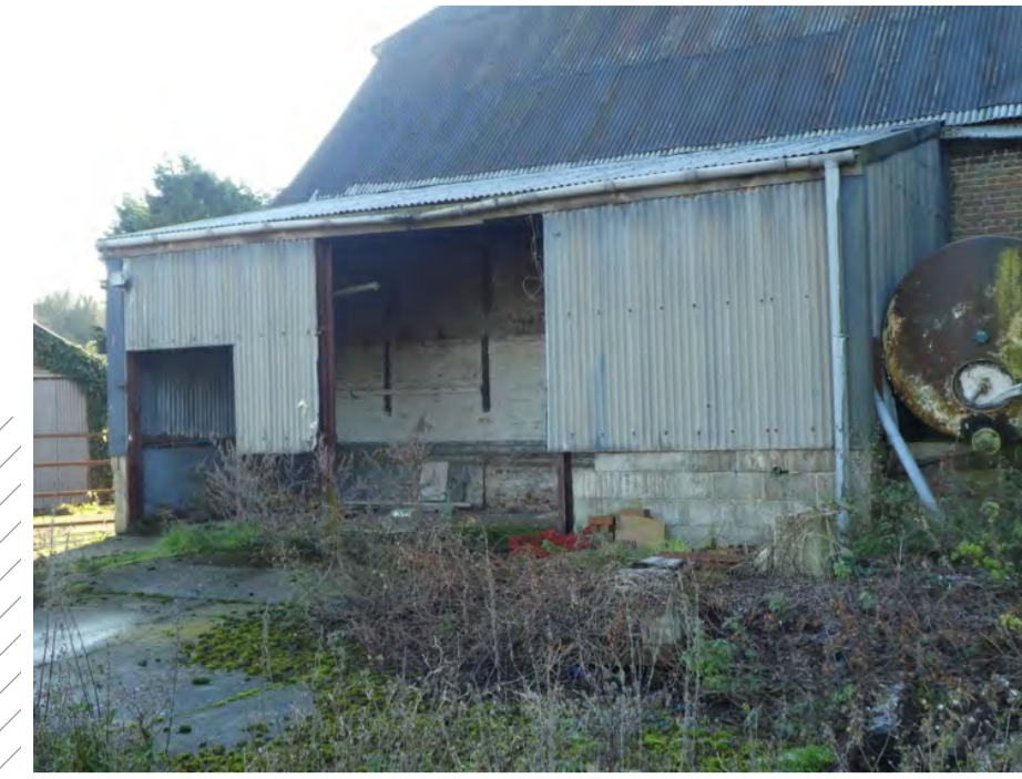
Lean-to 1 8.5x3.9x4.4m high